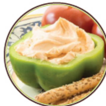
49389 Cheese and Vegetable Spread Dip 5#