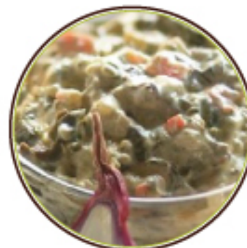
49391 Dip Spinach w/Water Chestnuts 5#