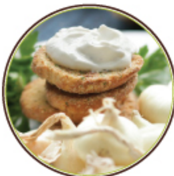
49469 Dip French Onion 5#