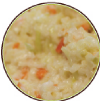
49399 Coleslaw Dixie Style 5#