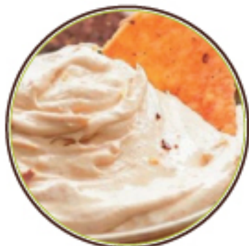
48814 Dip Taco 4.5#