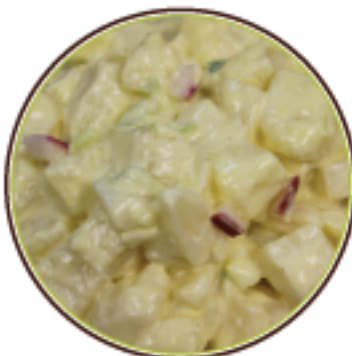
49400 Red Potato Salad Old Fashioned American 5#