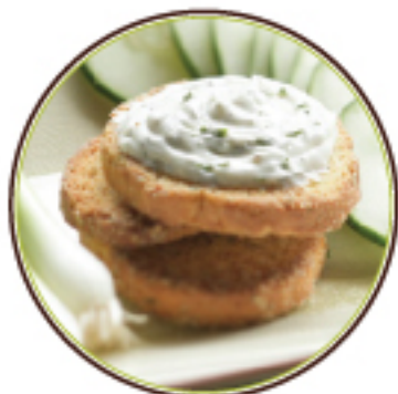
49392 Dip Dill 5#