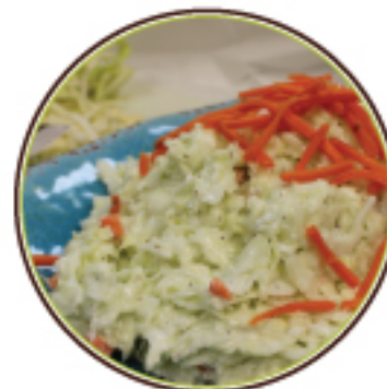
49406 Blue Ribbon Coleslaw 5#