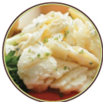
49407 Sliced Potato Salad Gramma 5#